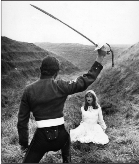
Troy (Terence Stamp) shows off his swordsmanship to Bathsheba (Christie) at Maiden Castle. Far from the Madding Crowd.