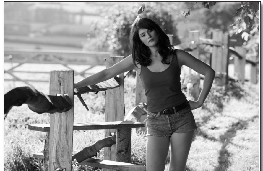
Gemma Arterton plays the eponymous heroine in Tamara Drewe .

The Mirrors of Fetters, shooting on location near Poole Quay.